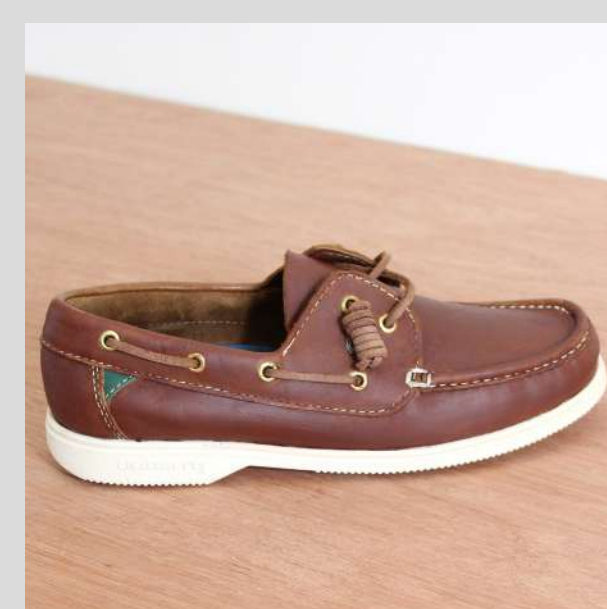
Images show Mid Brown Colourway being used on Admirals smooth leather